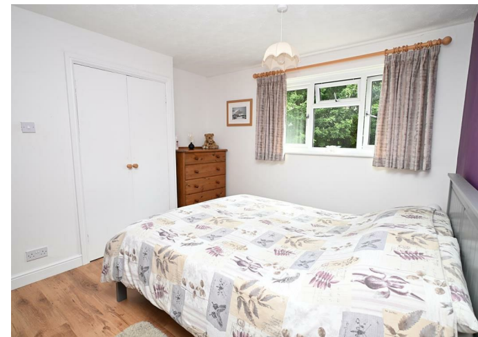
3 BEDROOM MID TERRACE